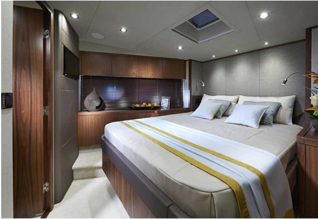
Interior: Main Cabin