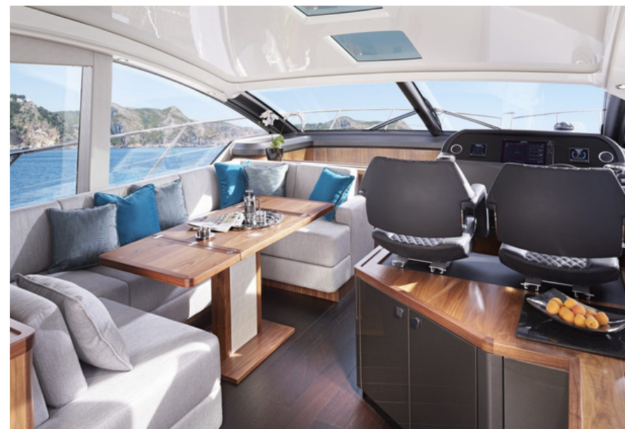
Saloon & helm station